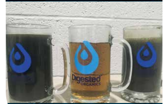
Food Waste Digestate

Our online dashboard for remote monitoring and data reporting.