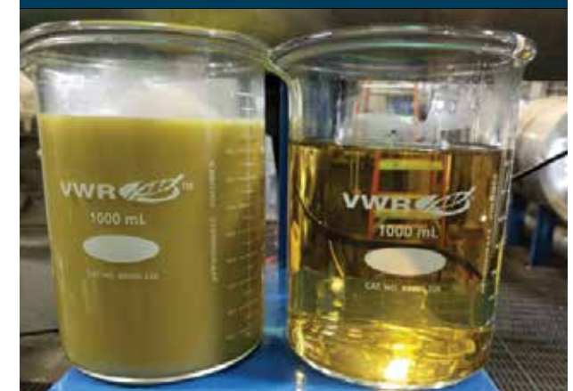
Oil Washing Wastewater at Biodiesel Plant