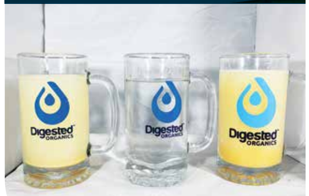
Food & Beverage Wastewater