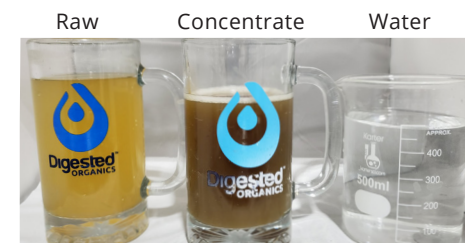
MN Dairy Farm Leachate Treatment