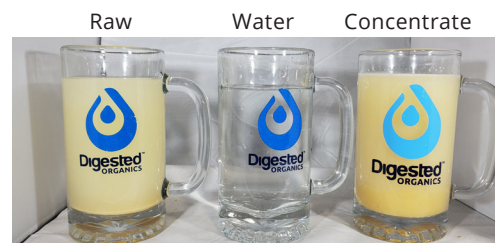
WI Dairy Farm Leachate Treatment